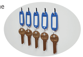
Internal Key Hooks