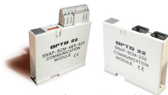
SNAP Serial Communication Modules

Both SNAP serial communication modules work with SNAP PAC Ethernet-based brains and rack-mounted controllers, both standard wired models and Wired+Wireless™ models. (They do not work with serial-based SNAP PAC brains.) These modules snap into Opto 22 SNAP PAC mounting racks right