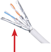
Foil shield in cable prevents unwanted alien crosstalk