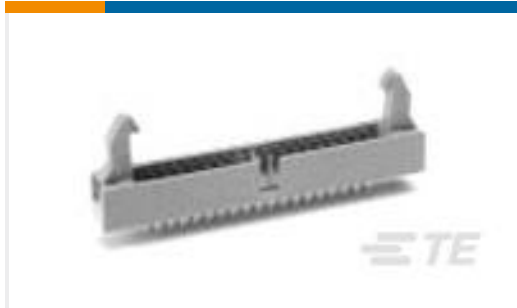
TE Part #1-1761685-1 IDC LOW PRO HDR 34P VERT SHT LAT