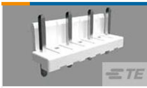
TE Part #1-1123724-4 3.96EP HDR ASSY 4(7)P NATURAL