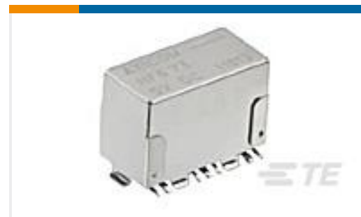
TE Part #1-1462052-9 HF6 95=50OHM140MW 9V BIST 2COIL