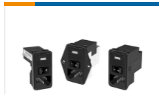
TE Part #8-6609940-3 CORCOM P SERIES MULTI-FUNCTION INLET FIL