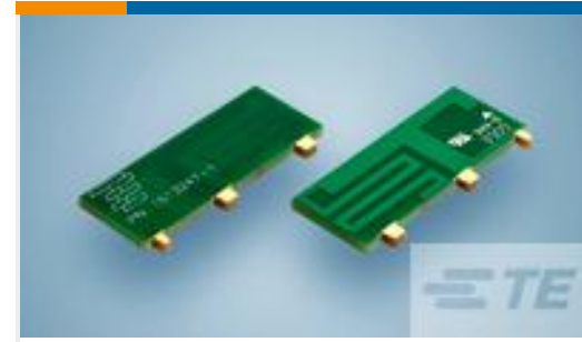
TE Part #1513247-1 PCB US DUAL BAND ANTENNA