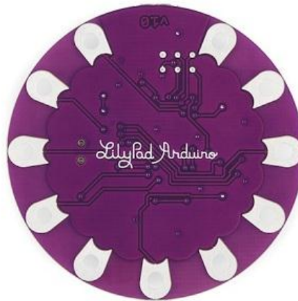
LilyPad Arduino USB (rear)