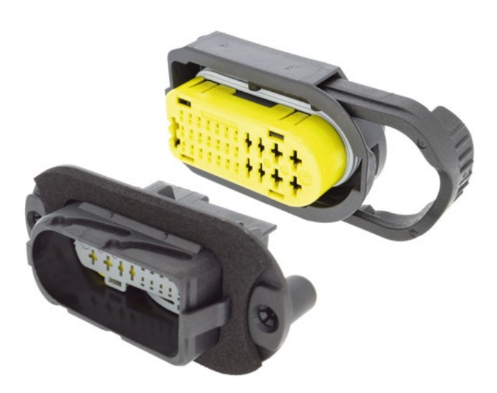
SICMA Panel-Through Unsealed 29W Female & Male