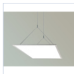
70033 SUSPENSION WIRE PANELED