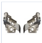
70049 CLIPS UNIVERSALE CGESSO M600