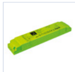
19359 INV P&L LED SE/SA 3H 20-60V