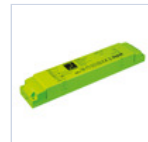
19358 INV P&L LED SE/SA 1H 20-60V