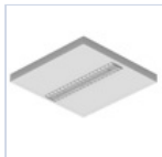
20089 CORNICE PLAF BACKLITE 600X600