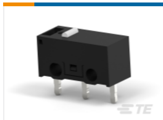
TE Model / Part # 2351444-1 UMINSA SW PPLUN 0.74N 0.1A/30VDC SC PCB