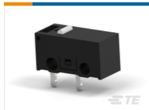
TE Model / Part # 2351444-3 UMINSA SW PPLUN 0.74N 0.1A/30VDC NO PCB