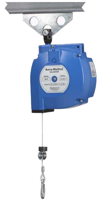
BF / BFL Models