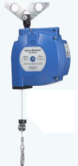
BF / BFL Model