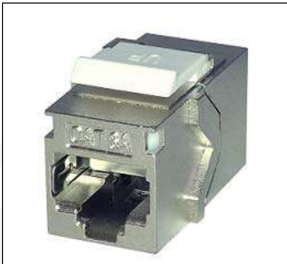
Category 6A Shielded Keystone Panel Mount Coupler (SGACK2S, SGACK2S-24)