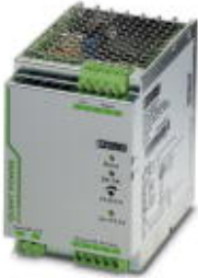
Primary-switched QUINT DC/DC converter for DIN rail mounting with SFB (Selective Fuse Breaking) Technology, input: 24 V DC, output: 24 V DC/20 A

Please be informed that the data shown in this PDF Document is generated from our Online Catalog. Please find the complete data in the user's documentation. Our General Terms of Use for Downloads are valid ( http://phoenixcontact.com/download )