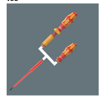
Suitable for Kraftform handles 7400 VDE and 817 VDE .

Handle/interchangeable blade system – Kraftform Kompakt VDE