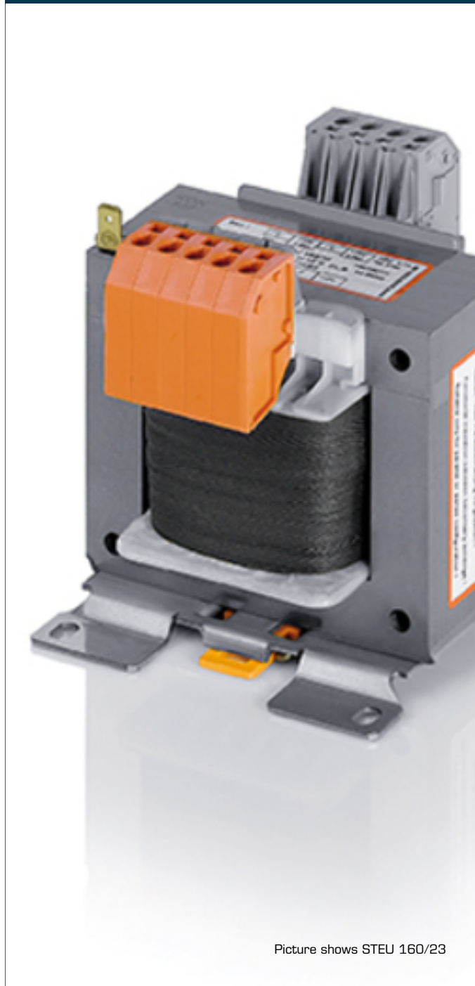
Picture shows STEU 160/23