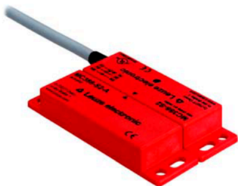
Part no.: 63001041 MC388-S2C5-AL-F Magnetically coded sensor