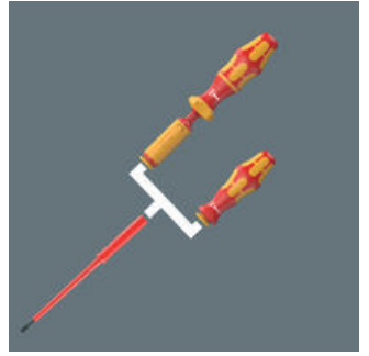
Suitable for Kraftform handles 7400 VDE and 817 VDE .