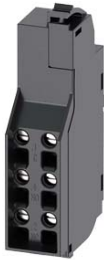
AUXILIARY SWITCH CHANGEOVER CONTACTS TYPE HP (14MM) ACCESSORY FOR 3VA-BREAKER