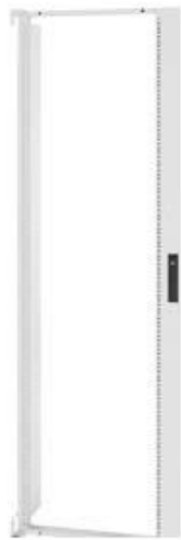
SIVACON SICUBE 19" TURNING FRAME. HEAVY DUTY H