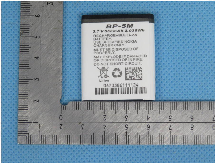
鑫宇环仅对原报告照片中的样品负责 AGC authenticate the photo on original report only

The results shown in this test report refer only to the sample(s) tested unless otherwise stated and the sample(s) are retained for 30 days only. The document is issued by AGC, this document cannot be reproduced except in full with our prior written permission. The document is available on request and the brief information for its validation can be assessable and confirmed at http://www.agc-cert.com