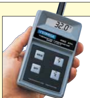
450-ATH high accuracy handheld thermometer.