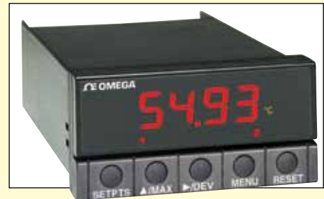
DP25-TH Series 1/2 DIN precision thermistor meter/controllers.