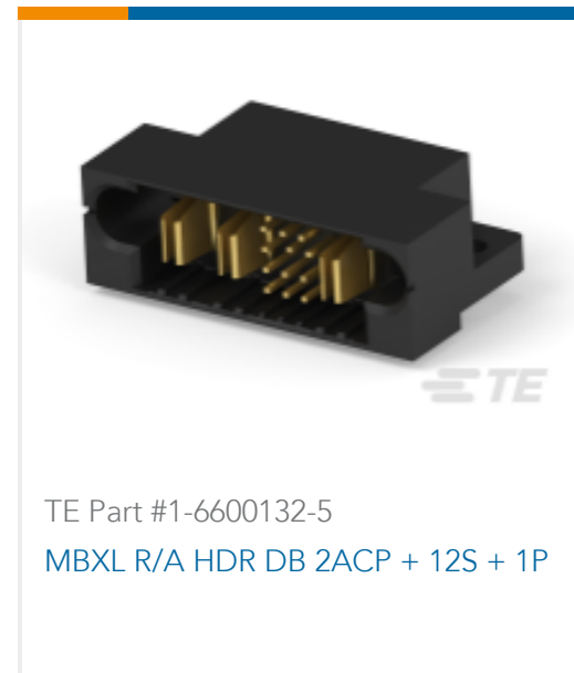
TE Part #1-6600132-5 MBXL R/A HDR DB 2ACP + 12S + 1P