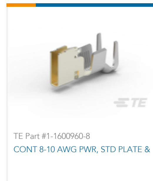
TE Part #1-1600960-8 CONT 8-10 AWG PWR, STD PLATE & CONNECTOR