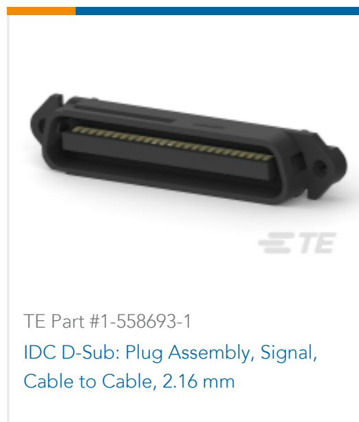
TE Part #1-558693-1 IDC D-Sub: Plug Assembly, Signal, Cable to Cable, 2.16 mm