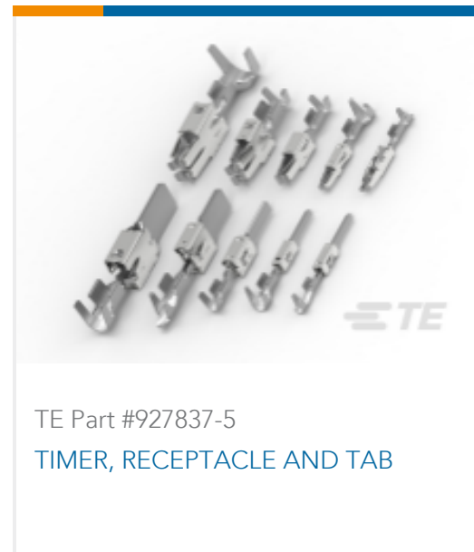
TE Part #927837-5 TIMER, RECEPTACLE AND TAB