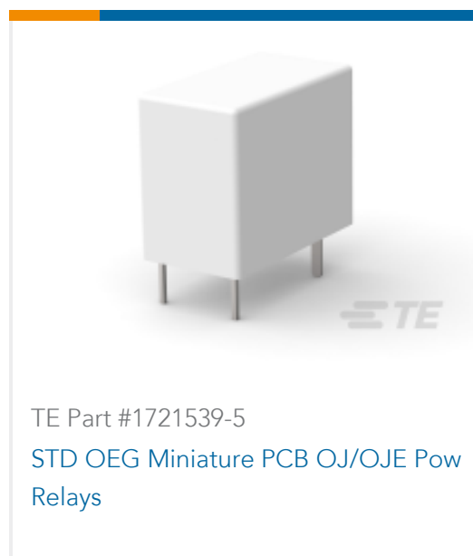
TE Part #1721539-5 STD OEG Miniature PCB OJ/OJE Pow Relays