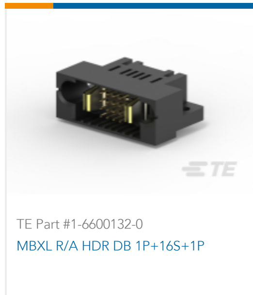
TE Part #1-6600132-0 MBXL R/A HDR DB 1P+16S+1P