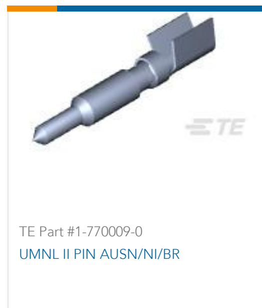
TE Part #1-770009-0 UMNL II PIN AUSN/NI/BR