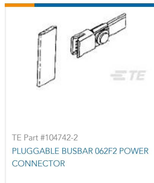
TE Part #104742-2 PLUGGABLE BUSBAR 062F2 POWER CONNECTOR