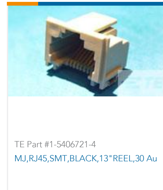
TE Part #1-5406721-4 MJ,RJ45,SMT,BLACK,13"REEL,30 Au