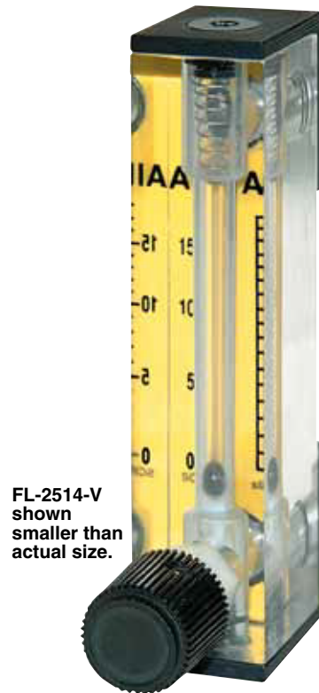
FL-2514-V shown smaller than actual size.

The FL-2500 Series direct read variable area flow meter kits offer versatility at a low cost. Each kit includes seven interchangeable direct read scales for air, water, Argon, CO 2 , Helium, Nitrogen and Oxygen. These economical kits are ideal for laboratories, schools or processes that use multiple gases.