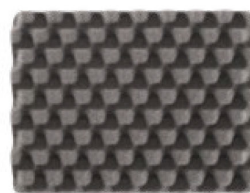
Convuluted Foam 1 × 45mm / 1 × 1.77"