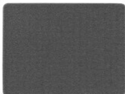
Base Foam 1 × 20mm / 1 × 0.79"