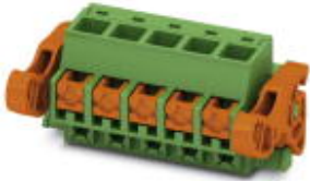
The figure shows a 5-position version

Plug component, nominal current: 12 A, rated voltage (III/2): 320 V, number of positions: 10, pitch: 5.08 mm, connection method: Push-in spring connection, Color: green, contact surface: Tin