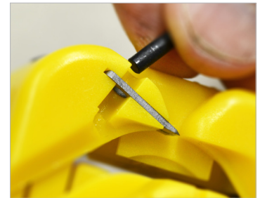
Fixed stainless steel blades require no adjustments and replace easily.

For more information or to locate the nearest authorized Ripley® distributor, please visit www.ripley-tools.eu or call +44 (0) 1384-400070 to speak to a customer service representative.