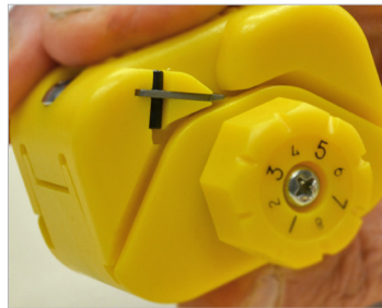
Spring-loaded design eliminates need to lock or clamp tool while in use.