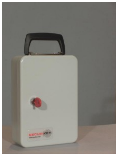
System 20 Portable