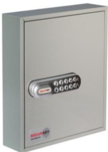
System 48 CL1000 Electronic Cam Lock