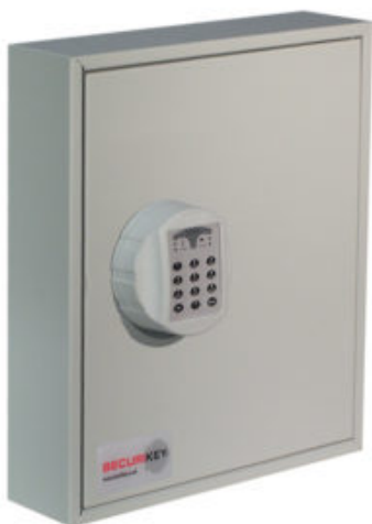
System 48 Electronic Lock REVO A