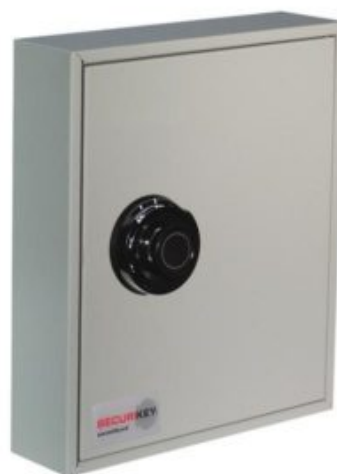
System 48 Dial Combination Lock