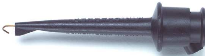
Model 4555 Do-It-Yourself Minigrabber Test Clip