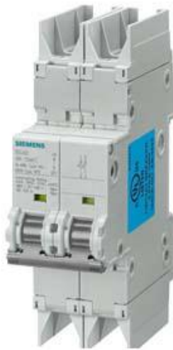
CIRCUIT BREAKER 10KA, 2POLE, C, 10A ACC. TO UL 489 - 480Y/277V