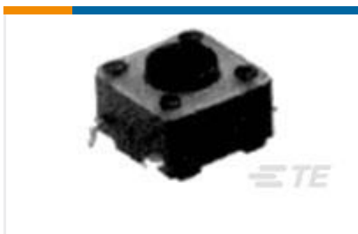
TE Model / Part #4-1437565-1 FSM4JSMA=SMT,TACTILE,PB SWITCH