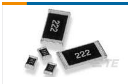
TE Model / Part #1622960-1 CRG0603 1% 4K7