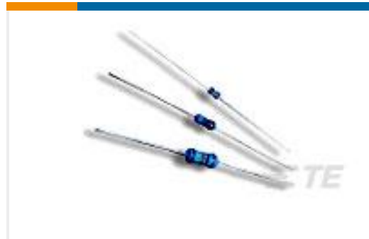
TE Model / Part #1622298-1 LR1 1% 10K