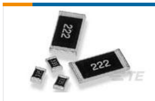
TE Model / Part #1622866-1 CRG0603 1% 1K0