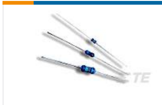
TE Model / Part #1622297-1 LR1 1% 100R