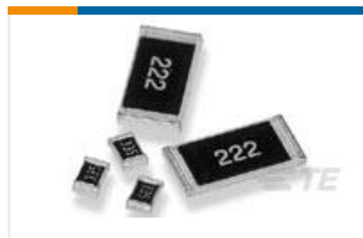
TE Model / Part #1622827-1 CRG0603 1% 100K