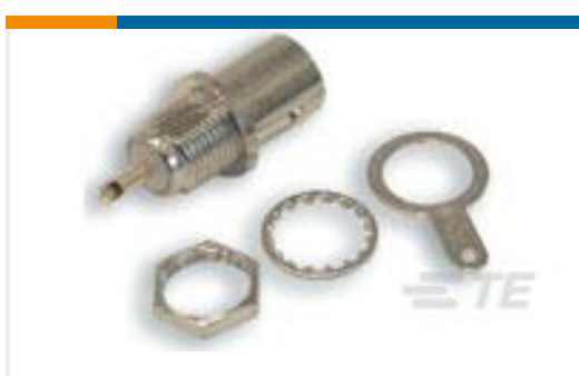
TE Model / Part #5-1634523-1 BNC BHSkt + TAG 50Ohm Nickel Pltd