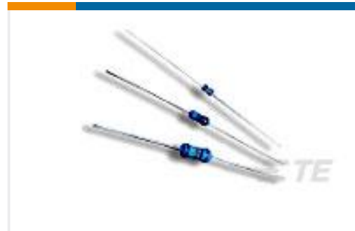
TE Model / Part #1622349-1 LR1 1% 1K0