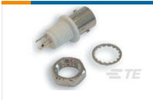
TE Model / Part #5-1634504-1 BNC Ins BHSkt 50Ohm Nickel Gold Pltd