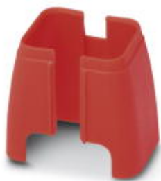
Security element for FL patch cable

Please be informed that the data shown in this PDF Document is generated from our Online Catalog. Please find the complete data in the user's documentation. Our General Terms of Use for Downloads are valid ( http://phoenixcontact.com/download )