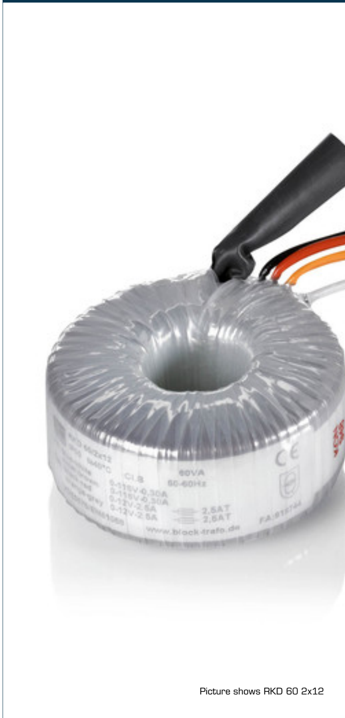
Picture shows RKD 60 2x12