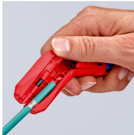
Stripping of a data cable