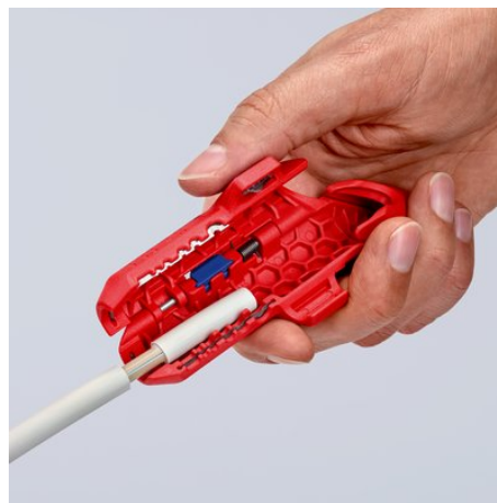
Stripping of a NYM cable