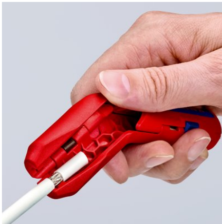
stripping of a coax cable