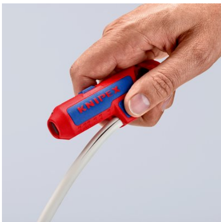
With concealed cutter in overhanging thumb rest on the side for convenient lengthwise cut