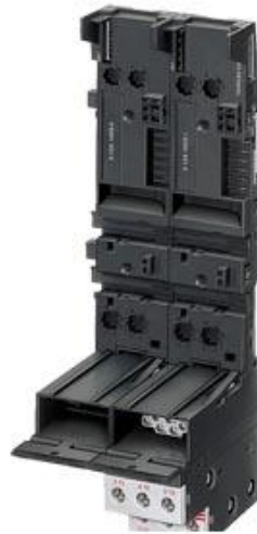
TERMINAL MODULE FOR ET 200S RS FOR REVERSING STARTER, WITH FEEDER CONNECTION