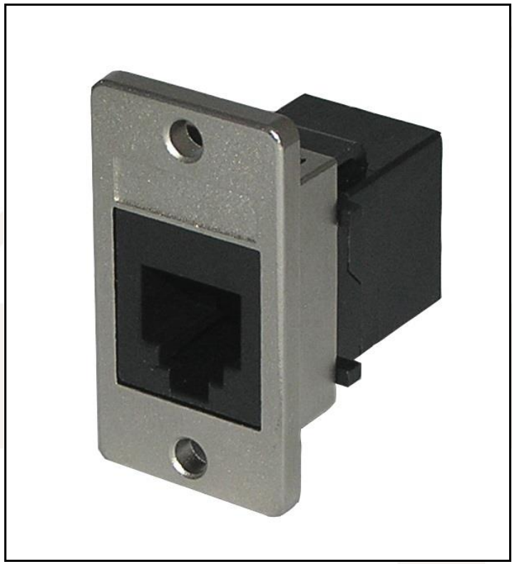
RJ12 6p6c Keystone Panel Mount Coupler (KCK66pm)