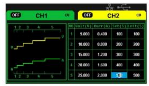
Panel timing output