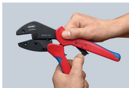
Changing position: service lever opens out for parallel jaw positioning