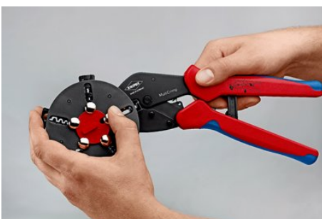
Changing the crimping dies: unlock the magazine position, take out the set of dies which the pliers have been pushed on