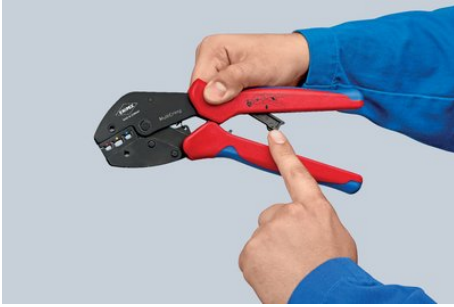
Fold in the service lever and press the pliers – ready for use again