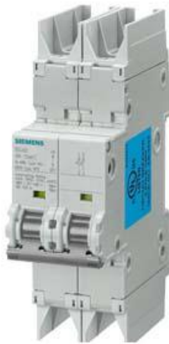
CIRCUIT BREAKER 10KA, 2POLE, D, 0.5A ACC. TO UL 489 - 480Y/277V