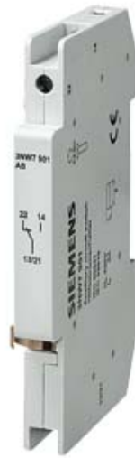
CONTROL SWITCH 1NO+1NC FOR CYLINDRICAL FUSE BASE SIZE 14X51 MM