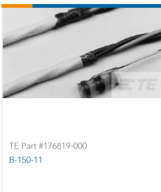
TE Part #176819-000 B-150-11