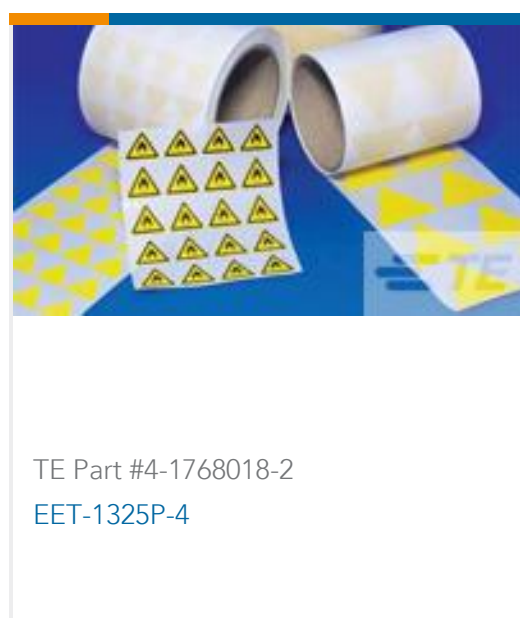
TE Part #4-1768018-2 EET-1325P-4