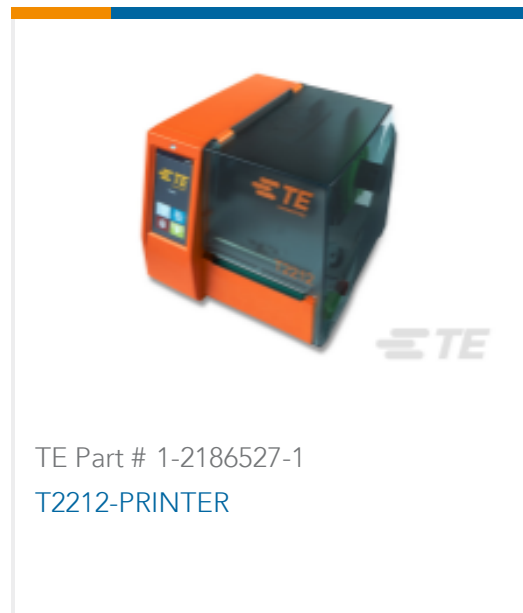
TE Part # 1-2186527-1 T2212-PRINTER