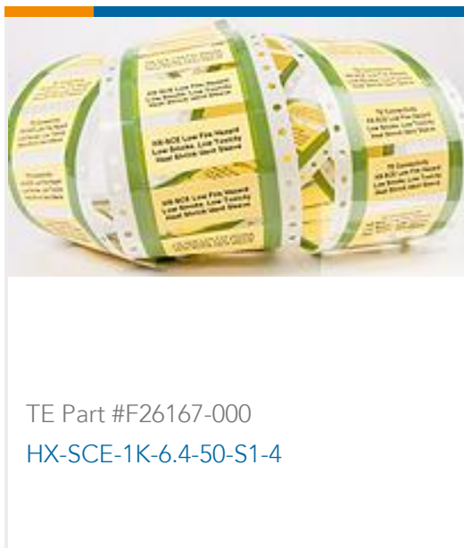
TE Part #F26167-000 HX-SCE-1K-6.4-50-S1-4