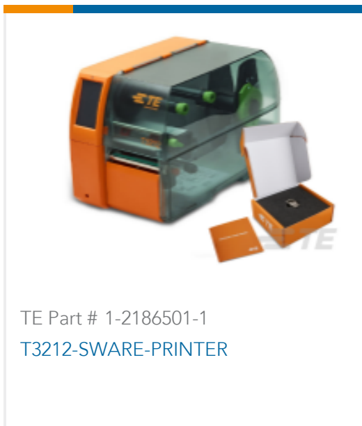
TE Part # 1-2186501-1 T3212-SWARE-PRINTER