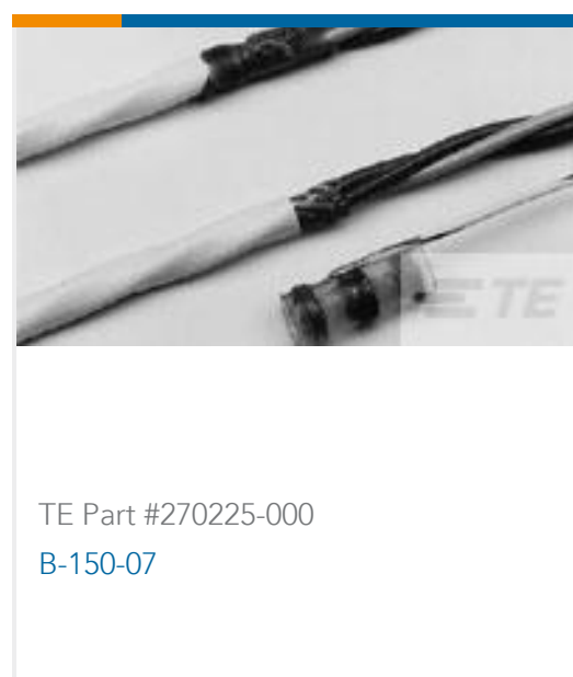
TE Part #270225-000 B-150-07