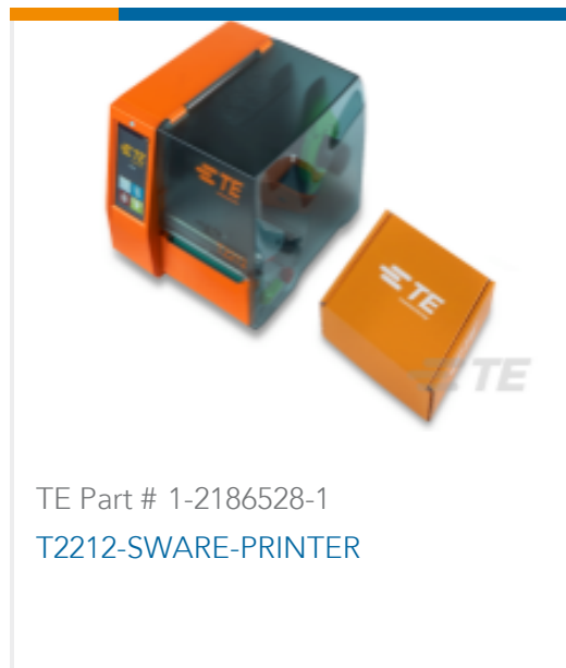
TE Part # 1-2186528-1 T2212-SWARE-PRINTER