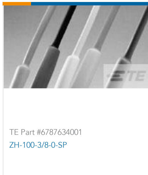
TE Part #6787634001 ZH-100-3/8-0-SP