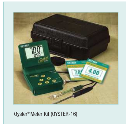
Oyster® Meter Kit (OYSTER-16)