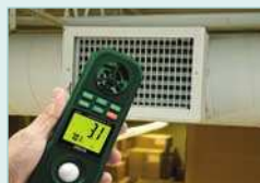
Air Velocity and Temperature