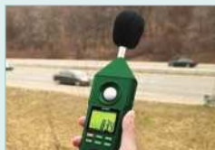
Sound Level Measurement