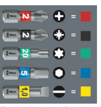
"Take it easy" tool finder with colour coding according to profiles and size stamp – for simple and rapid accessing of the required tool.