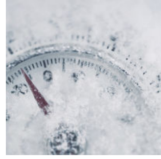
The stainless steel tools from Wera are vacuum ice-hardened and have the hardness and strength needed for screw connections. There are no limitations to the industrial applications they are suitable for.