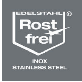
Solution to the rust problem: screw stainless steel together with stainless steel! Wera stainless steel tools are manufactured out of stainless steel so unsightly rust can be avoided.

Screw stainless steel together with stainless steel!