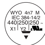
WYO 3.3 nF to 12 nF

All approval marks are also shown on the label.