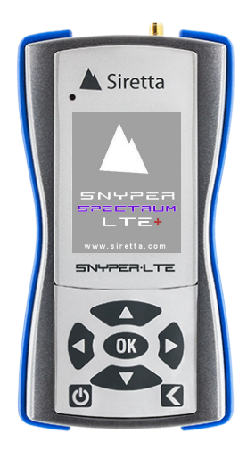
*Neither V1 nor V2 rmodels equire a SIM in order to function.

4G/LTE,3G/UMTS & 2G/GSM Network Signal Analyser with liveSCAN