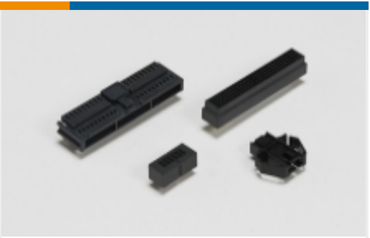
PCB Connector Shrouds(1)