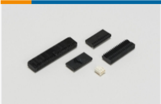
Wire-to-Board Connector Assemblies & Housings(5)