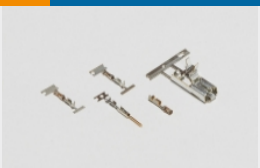
Wire-to-Board Connector Contacts(66)