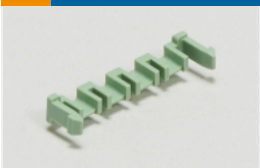
PCB Latches, Locks & Retainers(2)