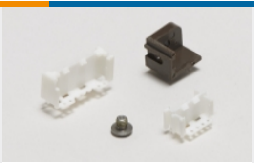
PCB Connector Mounting(1)