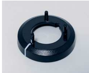
A7516010 Nut cover 16, with line ABS (UL 94 HB) black RAL 9005