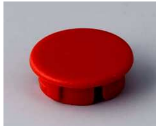
A4116002 Cover 16, without line ABS (UL 94 HB) red RAL F12/0-10