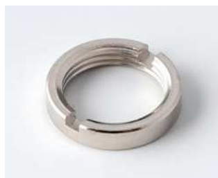
A6210009 Round nut M10 x 0.75