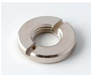
A6207009 Round nut M7 x 0.75