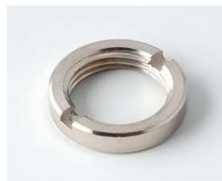
A6295009 Round nut 3/8"-32G