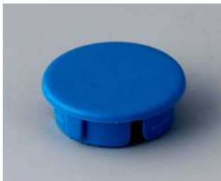
A4116006 Cover 16, without line ABS (UL 94 HB) light blue RAL 5012