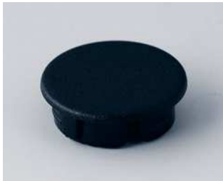
A4116000 Cover 16, without line ABS (UL 94 HB) black RAL 9005