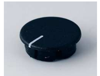
A4116100 Cover 16, with line ABS (UL 94 HB) black RAL 9005