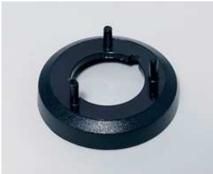
A7516000 Nut cover 16, without line ABS (UL 94 HB) black RAL 9005