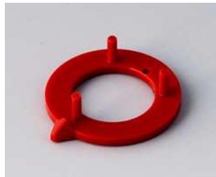
A4216002 Arrow disk 16 ABS (UL 94 HB) red RAL F12/0-10