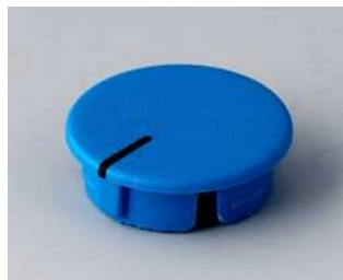
A4116106 Cover 16, with line ABS (UL 94 HB) light blue RAL 5012