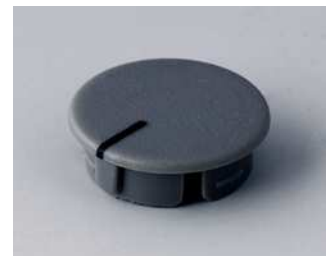
A4116108 Cover 16, with line ABS (UL 94 HB) dusty grey RAL 7037