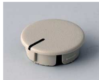
A4116107 Cover 16, with line ABS (UL 94 HB) pebble grey RAL 7032