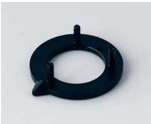
A4216000 Arrow disk 16 ABS (UL 94 HB) black RAL 9005