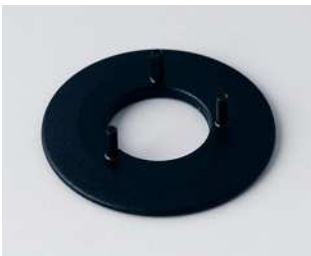
A7316000 Disk 16, without line ABS (UL 94 HB) black RAL 9005