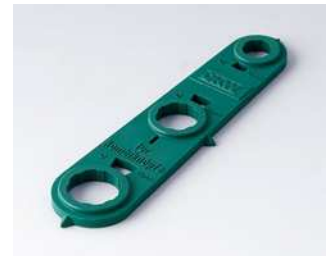
A6402005 Adjusting key 10/13/16 ABS (UL 94 HB) green