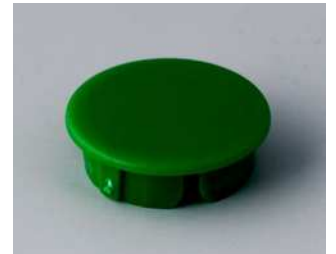
A4116005 Cover 16, without line ABS (UL 94 HB) green RAL F12/0-43