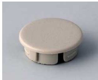
A4116007 Cover 16, without line ABS (UL 94 HB) pebble grey RAL 7032