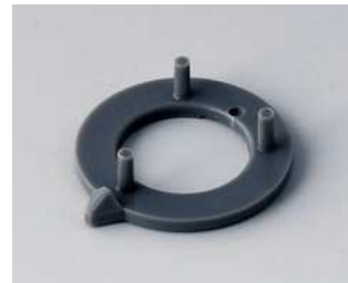
A4216008 Arrow disk 16 ABS (UL 94 HB) dusty grey RAL 7037