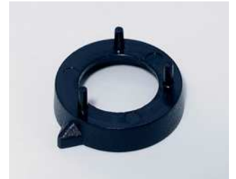
A7616000 Nut cover 16, without line ABS (UL 94 HB) black RAL 9005