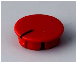
A4116102 Cover 16, with line ABS (UL 94 HB) red RAL F12/0-10