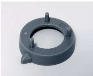
A7616008 Nut cover 16, without line ABS (UL 94 HB) dusty grey RAL 7037