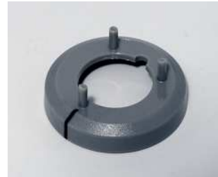
A7516018 Nut cover 16, with line ABS (UL 94 HB) dusty grey RAL 7037