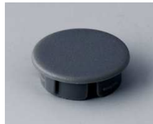
A4116008 Cover 16, without line ABS (UL 94 HB) dusty grey RAL 7037