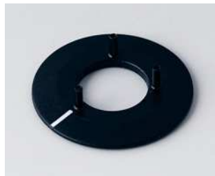
A7316010 Disk 16, with line ABS (UL 94 HB) black RAL 9005

Subject to technical modification without notice.