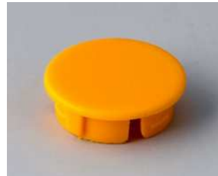
A4116004 Cover 16, without line ABS (UL 94 HB) yellow RAL F12/0-1