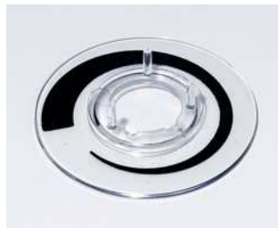
A4416020 Dial 16 PC (UL 94 HB) transparent