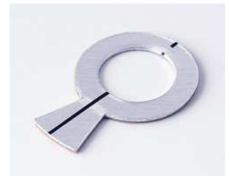
A6016019 Stator 16 Aluminium