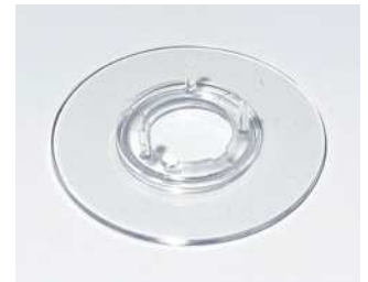
A4416001 Dial 16 PC (UL 94 HB) transparent