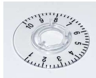
A4416060 Dial 16 PC (UL 94 HB) transparent