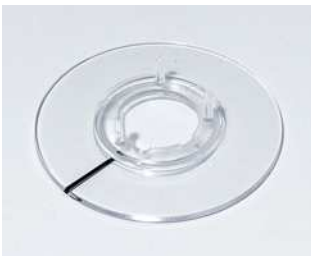
A4416010 Dial 16 PC (UL 94 HB) transparent