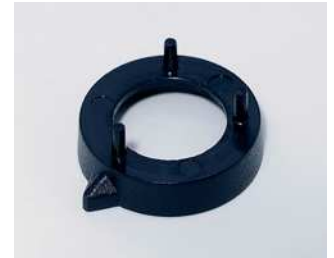
A7616000 Nut cover 16, without line ABS (UL 94 HB) black RAL 9005