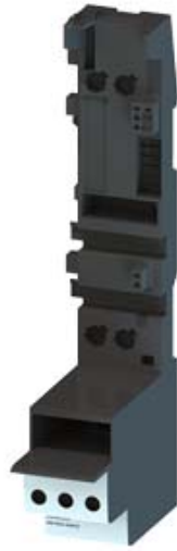
TERMINAL MODULE FOR ET 200S DS FOR DIRECT STARTER, WITHOUT FEEDER CONNECTION