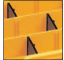
Basic 47: additional with dividers