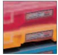
Basic 37: label on lid