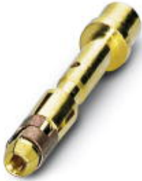
Crimp contact, turned, Single contact, Contact diameter: 1 mm, Crimp range: 0.06 mm 2 ...0.25 mm 2

Please be informed that the data shown in this PDF Document is generated from our Online Catalog. Please find the complete data in the user's documentation. Our General Terms of Use for Downloads are valid ( http://phoenixcontact.com/download )